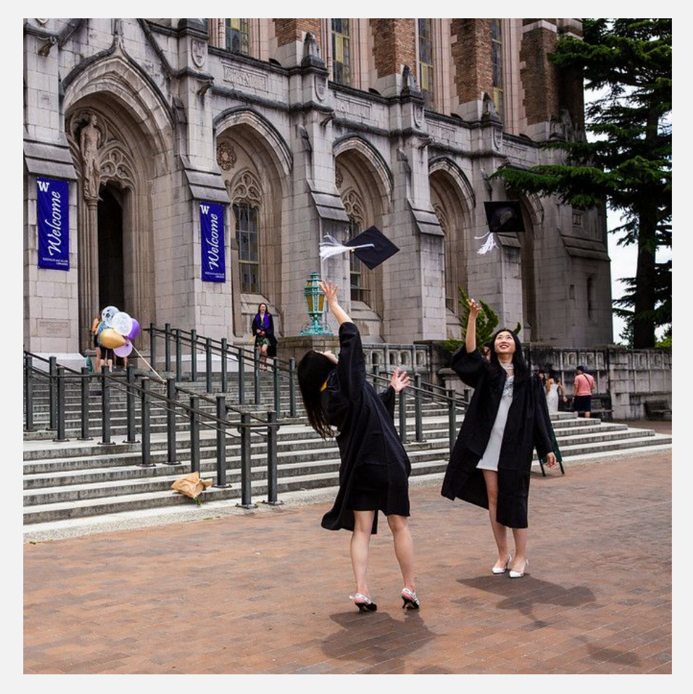
Students celebrate in front of Suzzallo Library