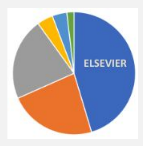
At $2.6M and 2.5% increase Elsevier is the most expensive journal package

Allocate $5.6M from six publishers: SpringerNature, Wiley, Sage, Oxford, Cambridge and Elsevier