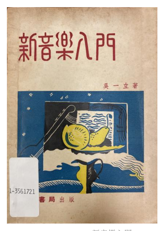
Xin yinyue rumen 新音樂入門 (An Introduction to New Music; Hong Kong, 1947)

complete TEAL's decade-long endeavor to make its hidden treasures discoverable to scholars worldwide.