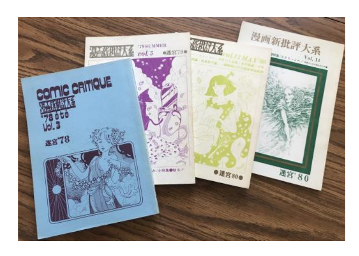
Issues of Manga shin hihyō taikei 漫画新批評大系 (Comic Critique)

(Labyrinth) in Japan, with the aim of founding a journal for reviews of manga works and artists, with a critical focus on identifying the significance of particular works and artists within manga history and pinpointing stylistic changes. The same year, with the aid of a commercial printer, they published the first issue of Manga shin hihyō taikei. They sold a hundred copies at the Nihon Manga Taikai 日本漫画大会(Japan Manga Convention), the biggest manga event of the time. Also in 1975, they created their own manga event, Komikku Māketto コミックマーケット (abbrev. Comiket コミ ケット). By the 1990s this had grown into the world's biggest manga event. More than 730,000 manga creators and fans attended in 2019! Their journal grew from humble beginnings to become one of the biggest influences in the manga world. TEAL holds four issues, published between 1978 and 1980.