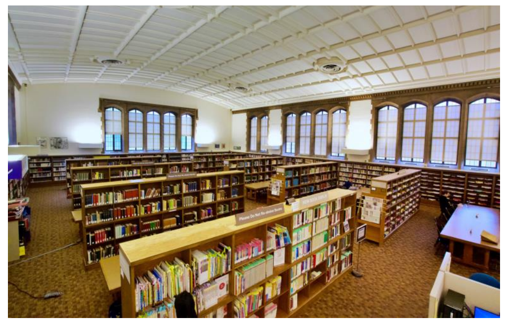
The space assessment seeks ways to optimize library design for user needs while preserving the distinctive architecture of spaces such as the Beckmann Reading Room.

While we treasure the library's atmosphere, we are always looking for ways to better serve users, and it is our hope that this data will give us new ideas on how to transform the library while preserving its unique feel.