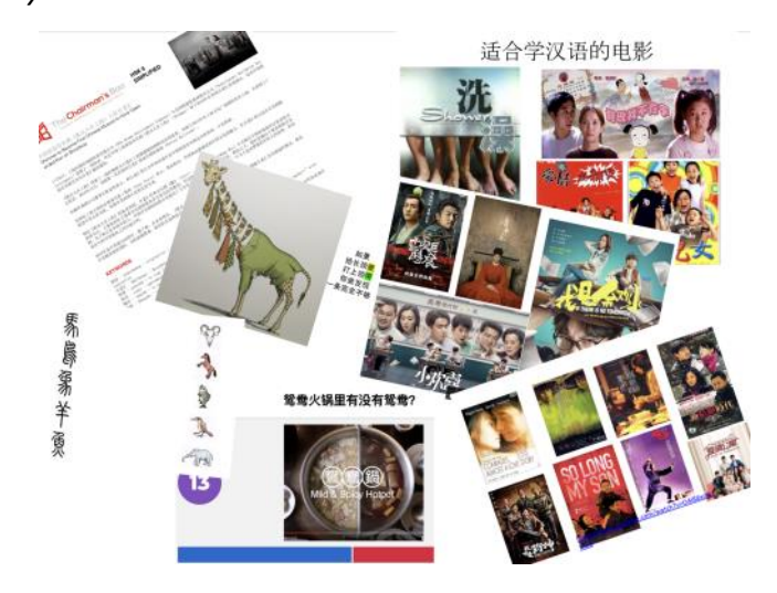
Chinese Tea Hour teaching materials

In the spring quarter of 2020, TEAL launched "Chinese Tea Hour," a weekly meeting (currently virtual) aimed at supporting Chinese language learning. Every Friday from 3:30 to 5:00 pm, students attended a Zoom meeting to practice new vocabulary, discuss interesting topics with other learners, play games, and ask native Chinese speakers questions. It was designed to complement a Chinese extensive reading course offered in the Department of Asian Languages and Literature, building on content from that course.