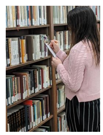
A student employee checks inventory.

In late November, the East Asia Library completed an inventory of the nearly 200,000 volumes currently housed in our General Stacks, which is the name we give to our main circulating collection in Gowen Hall. This phase of the inventory project took almost a full year of hard work from our dedicated