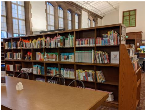
Tadoku bookshelf, TEAL

But Azusa and team didn't stop there. They continued their search for open-source materials, locating an additional 272 titles to meet and exceed the class goal of 200 books. For students to access these books, they had to be catalogued first. Ebook cataloging requires more advanced skills than typical cataloging. So when the pandemic hit, TEAL's Chinese Cataloging and Metadata Librarian, Jian P. Lee, changed up the training schedule to teach these critical skills and ramp up training for Keiko Hill, a new Japanese Cataloger/Tateuchi East Asia Library Serials & Electronic Resources Librarian. Keiko quickly learned the procedures and successfully cataloged all of the purchased eBooks by the second week of the spring quarter. Amazing!